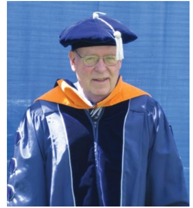
From Young Mining Engineer To Mines Honorary Doctorate

setting. I enjoyed being part of the process and working with the Provost and President. In a governance point of contact, there are challenges and opportunities. It's been a very positive experience.